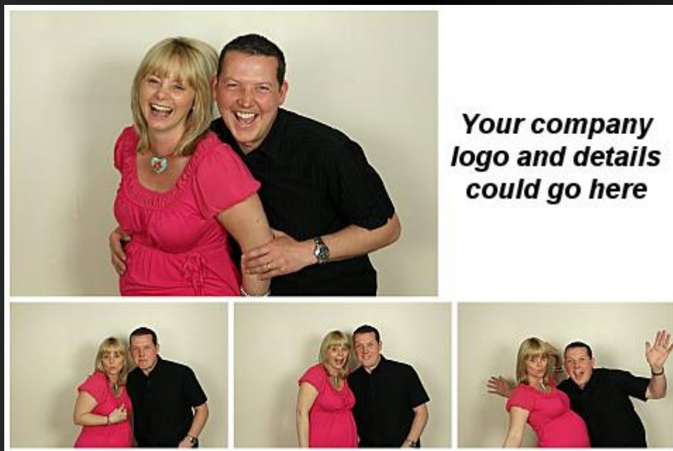
We Offer A Free Design Service Providing You With Custom Prints

We offer a range of different print options, from a straightforward strip with your 4 photos, to a sophisticated multi layer print with a background of your choice and additional foreground elements such as company logos, or details of your party or wedding. We can also set the system to produce double prints, this allows your guests to keep one print for themselves and another can be placed inside a guest book, with the metallic effect pens we provide the guests can leave comments, best wishes etc.