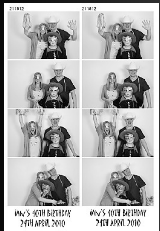
Double Print Allowing One to Be Placed In A Guest Book