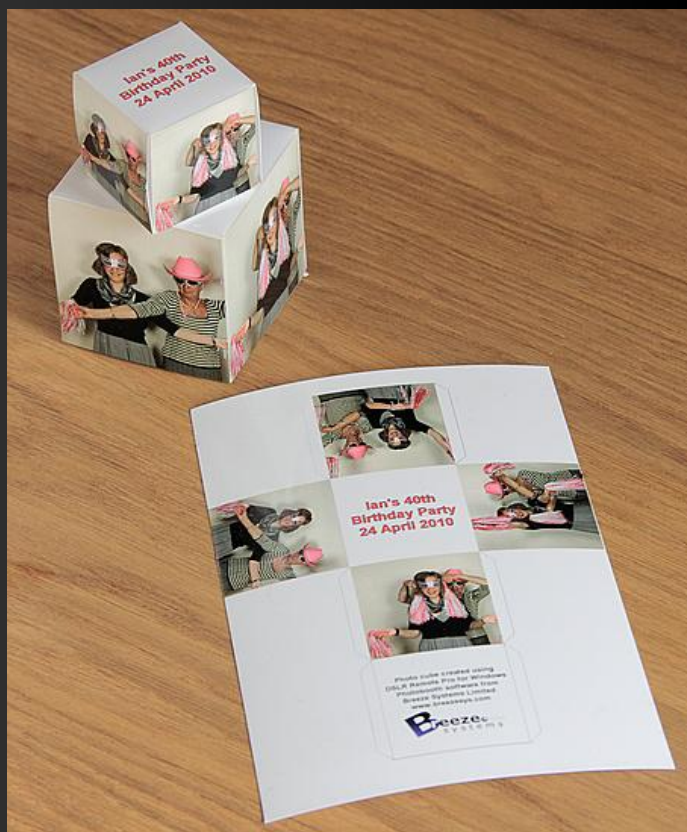
We Offer Fancy Options Such As Photo Cube Prints